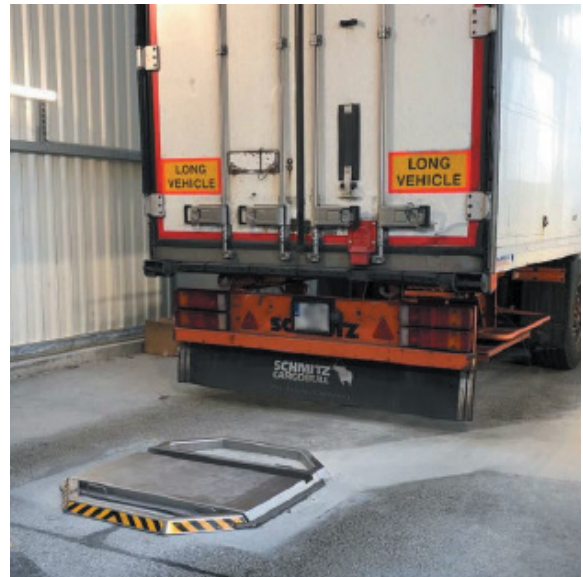
DETECT THE DANGER//